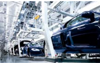
Factory Assembly Systems