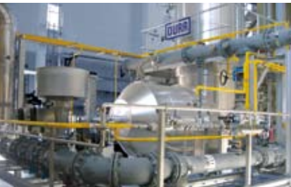
Environmental and Energy Systems