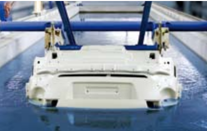
Paint and Final Assembly Systems