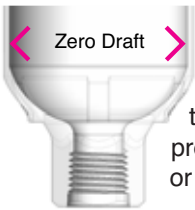
Zero Draft walls for smooth piston travel

Precision molded threads and a tapered counterbore at the 1/4" NPT outlet ensure a secure, leakproof seal. The outlet hex fits into a matching orifice on the retainer, allowing fast, tool-free installation of fittings and nozzles.