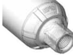
Molded ribs prevent splitting Hex fits into retainer for tool-free fitting/nozzle installation

Optimum cartridges are molded from a proprietary FDA- and RoHS-compliant polymer that provides exceptional clarity, chemical compatibility and dimensional stability.