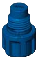
Tapered seat prevents leaks

End caps snap securely over cartridge flanges to prevent leaks and fluid contamination. The center pushbutton presses the cap against the cartridge wall to form a positive, airtight seal.