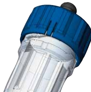
Ergonomic grip with locking tabs

Retainer caps feature locking tabs that snap into detents on the retainer body with an audible click. Only ¼ turn is required to lock the cap securely in place. A push-in air line connector on top of the cap eliminates the need for bayonet connectors.