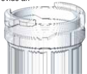
Chamfered entryway for easy installation

Optimum cartridge retainers are molded from high-tensile, clarified nylon that permits easy visual monitoring of fluid levels. Large textured ribs provide an ergonomic grip for cap installation.