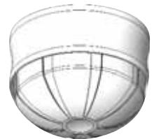
Molded channels dissipate trapped air

Unique channels help dissipate air during the filling process, reducing or eliminating the need to centrifuge. Dual wiping edges eliminate waste and residue to lower production costs and simplify disposal of used cartridges.