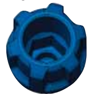
Hex on outlet cap allows automated installation

Self-venting outlet caps feature a large ribbed gripping area that simplifies manual installation, along with precision molded threads and a tapered seat that provide a snug, leakproof seal. A recessed hex molded into the cap exterior facilitates installation with automated equipment.