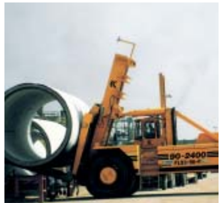
Kalmar has made the world's biggest forklift truck. With a capacity of a full 90 tonnes it is used to lift concrete pipe sections in water pipeline construction.