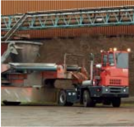
Custom-built machines with special attachments make work efficient and problem-free. The cab is high with large glass areas for the optimum visibility.