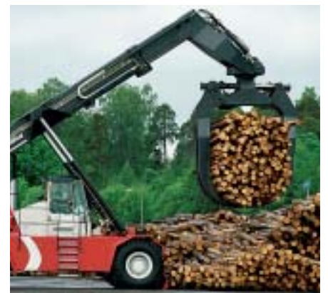
The log handler has been specially developed to handle timber, and can unload an entire trailer in one lift.

Our long experience and in-depth knowledge of the industry have also made us a complete partner to several sawmills, whereby we assume full responsibility for all handling processes. We tailor solutions to fit their handling requirements, including service and financing.