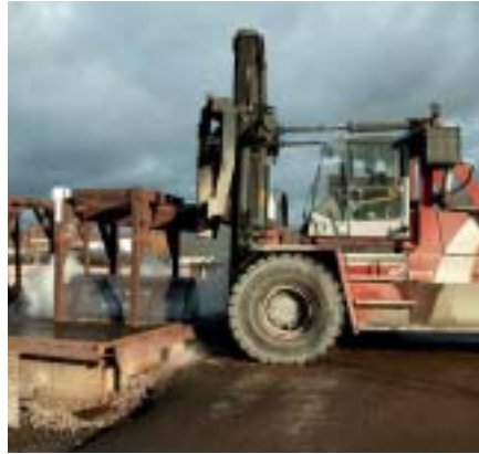
Kalmar's own fork-fitting system means that forks and attachments can quickly and easily be replaced by the machine operator.