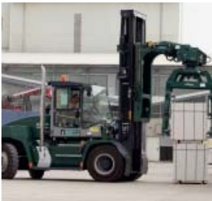
Stone handling calls for a precision attachment that can deal with often fragile loads. Kalmar offers a wide array of attachments from the leading manufacturers.