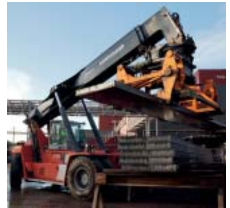
Kalmar's reachstackers can be fitted with special attachments for steel handling. Long reach and high lifting capacity allow great flexibility.

Needless to say, the fundamental factor is the machines' high quality, although our continually developing service solutions are equally important. Whatever the environment a machine will be working in, we can tailor a maintenance package. And in an industry as tough as steel, service quality will sooner or later be a critical factor in efficiency and accessibility.