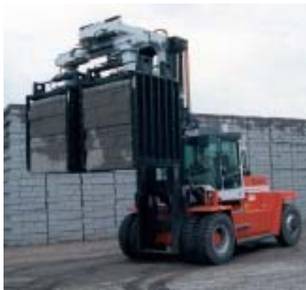
High strength steel in the lifting equipment ensures a long life, while optimally positioned cylinders allow the best possible driver visibility.