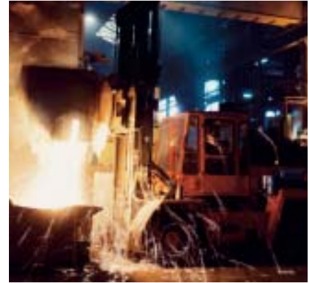
The machines can be specially equipped for even the most extreme environments in foundries, for example.