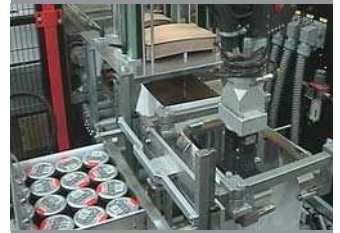
Sig. Ágústsson, Iceland