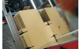
Geberit AG, Switzerland

SOCO SYSTEM U.K. Unit 18, Palmerston Street Hanley, Stoke-On-Trent Staffs. ST1 3EU Tel +44 1782 274100 Fax+44 1782 272696 info@socosystem.co.uk www.socosystem.com