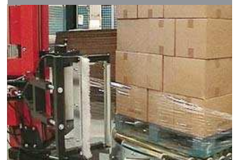
United Milk, England