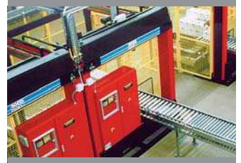
Altmark Käserei, Germany