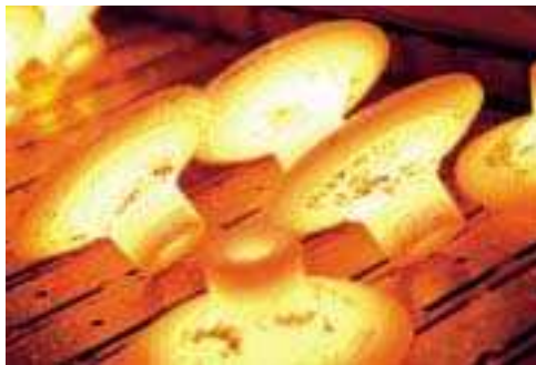
▲ Axle journal