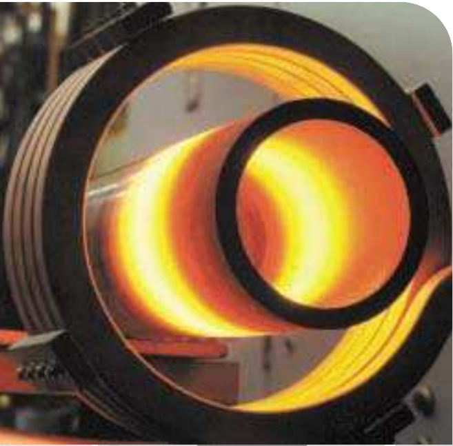
▲ The induction principle

Our service team and commissioning engineers are on call for our customers worldwide at any time.