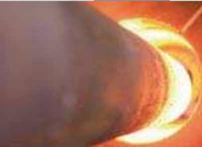
▲ End heating