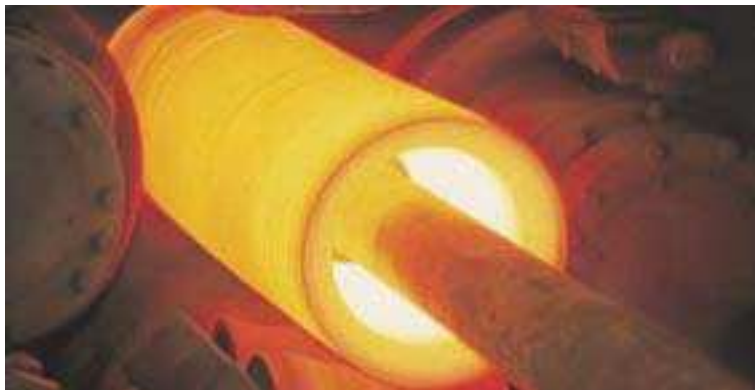
↑ Cross-roll piercer