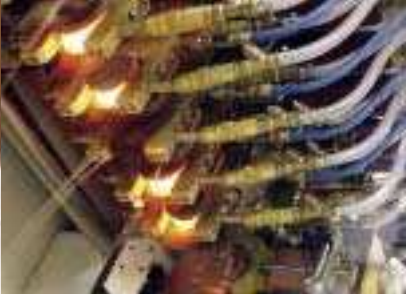
▲ Crankshaft hardening