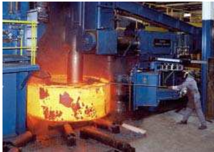
▲ Ring rolling