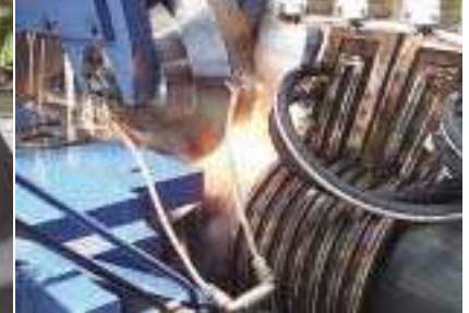
↑ HFI tube welding