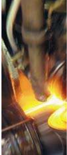
▲ Tube welding