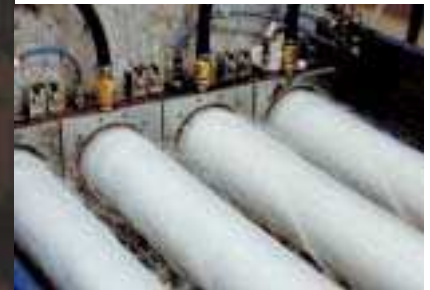
↑ Continuous caster for Al extrusion billets