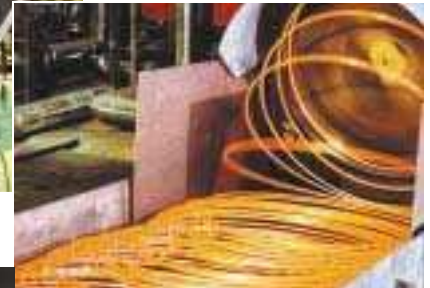
↑ Loop laying head with loop cooling conveyor (LCC®)