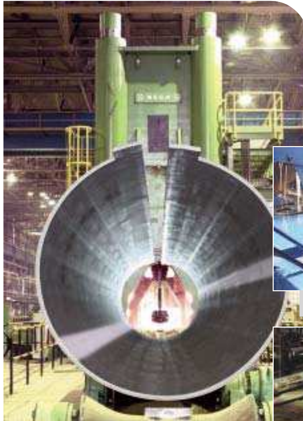
↑ Pipe forming press

Our goal is to create a competitive lead for our customers!