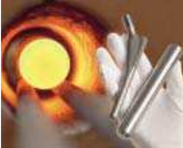
▲ Inductive heating