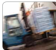
Ports and Logistics

Cascade Corporation • PO Box 20187 • Portland, OR 97294-0187 • 800 CASCADE (227.2233) • Tel 503.669.6257 • Fax 800.693.3768 • Fax 503.669.6367 Cascade Canada Ltd. • 5670 Timberlea Blvd. • Mississauga, Ontario L4W 4M6 • Canada • 800.380.2272 • Tel 905.629.7777 • Fax 905.629.7785