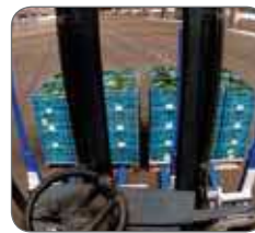
Food Producing Industry